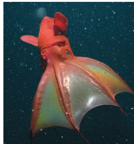
pages 1079 &amp; 1118

A transcription factor required for gene suppression in regulatory T cells is identified.