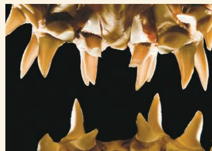
SCIENCE SIGNALING Row upon row of shark teeth.